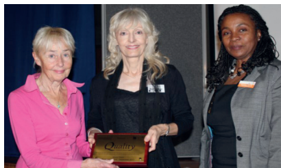
Accredited and Re-accredited teams recognised with the well-regarded GSF Quality Hallmark Award

As the most widely used end of life care improvement programme for frontline staff, GSF has been at the forefront of the national momentum of best practice since 2004. GSF Care Homes Training Programme and Accreditation is recognised by:-