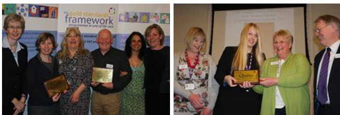
Round 1 Accredited wards Yarty & Yeo from RD & E (top left) and Ward 23 from Morecambe Bay (top right) with their Awards, March Conference 2015