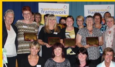
Cornwall Community Hospital Staff receive their GSF Quality Hallmark Award Sept 2014

GSF Quality Improvement Programme for Community Hospitals helped improve the quality of end of life care in rural community hospitals, and enabled more to live well and die well inline with their wishes and preferences.