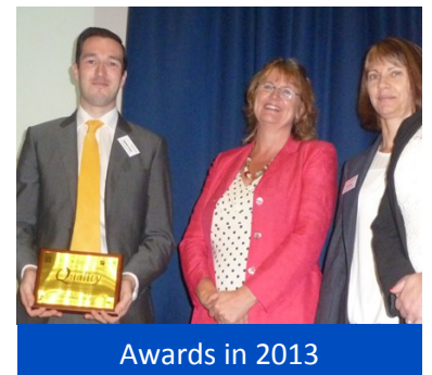
Awards in 2013

"The effort and time invested in the Going for Gold programme in refining and expanding our supportive care register was always seen by the practice as a valuable enhanced service for our patients. However, with the introduction of the Avoiding Unplanned Admissions DES, which complements the ethos of Going for Gold, this has allowed us to seamlessly transition this cohort into the DES and conjointly run each programme side by side, augmenting our patients care further."