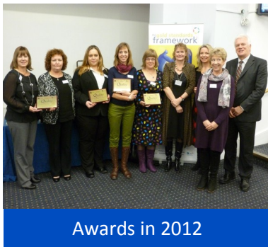
Awards in 2012

"This year's GSF accredited practice has demonstrated really significant changes and build on the achievements of the last nine practices. The practice has clearly show us what is possible and achievable and how implementing GSF can support other competing agendas such as the DES for unplanned admissions - clearly demonstrating that high quality care can be delivered for all people nearing the end of life, despite mounting pressures in primary care. The practice has made a difference for their patients and families and are an inspiration to us all." Prof Keri Thomas GSF Centre September 2014