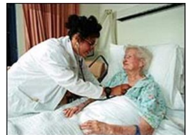
Reduced length of stay by average 3 days, some 13 days - 2014 Phase 3